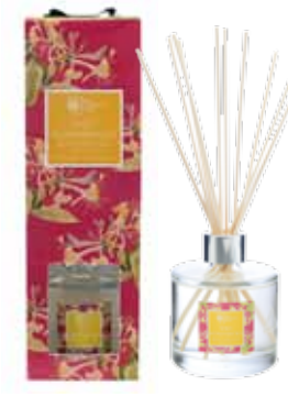
Wild Honeysuckle RH5913

This beautiful fragrance combines orange blossom with gardenia and green leafy top notes, all resting on a base of warming amber and musk.